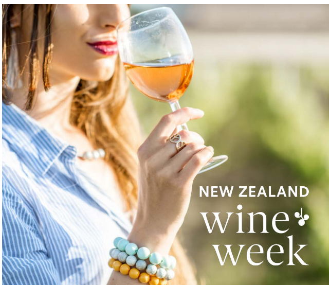
Mock-ups of social media tiles

Create social posts with your own imagery and the logos and assets from the #nzwineweek toolkit. A range of NZW social media tiles and imagery are also available to download and use from the toolkit (see options over page).