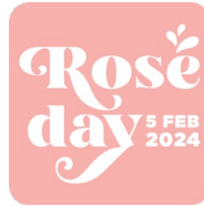
Rose Day 24_Stacked_PinkBox_logo