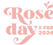
Rose Day 24_Stacked_Pink_logo