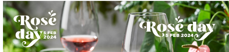
Rose Day 24_Stacked_WHT_REV_logo